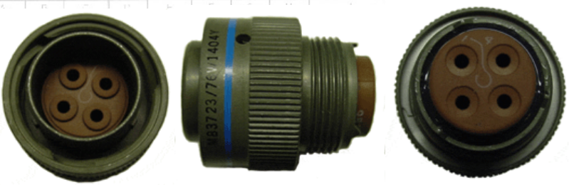
M83723/76 Plug, Bayonet, Pin Contacts Class A, G, R, W